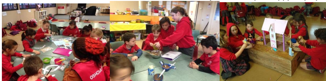
Making colourful boomerangs - The Lily's Cooking Club Smartie Fudge - Playing with some new toys!

We also welcomed two fish to our OSHClub family this week. A white and an orange gold fish. We also received lots of new resources this week that everyone was super happy to play with!